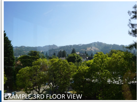
EXAMPLE 3RD FLOOR VIEW