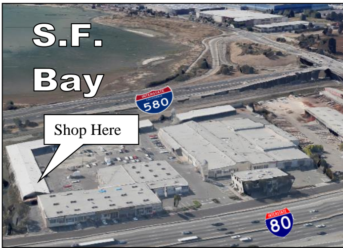
Facing 255,000+ Captive Cars/day